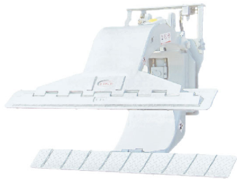
7-2 Revolving Tyre Clamps 40